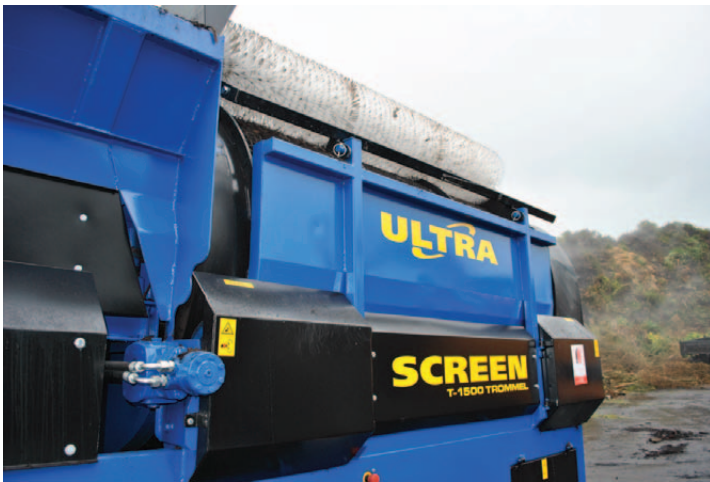
High wear brush to clean the trommel drum mesh, ensuring maximum output