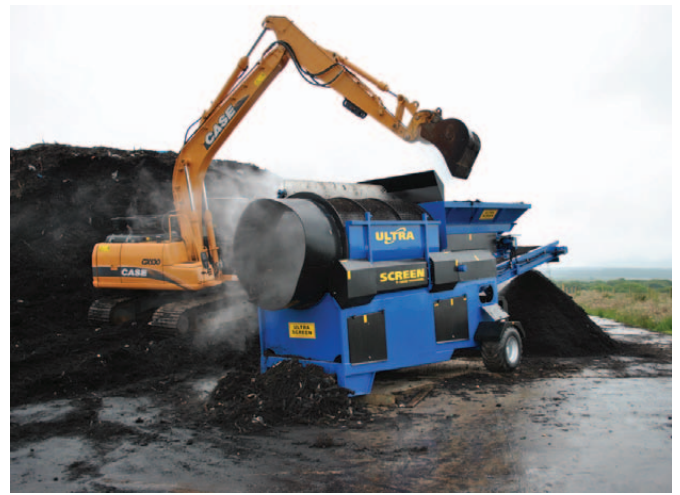
Ultra Screen can be easily loaded by a range of utility excavators, telehandlers and mini loaders