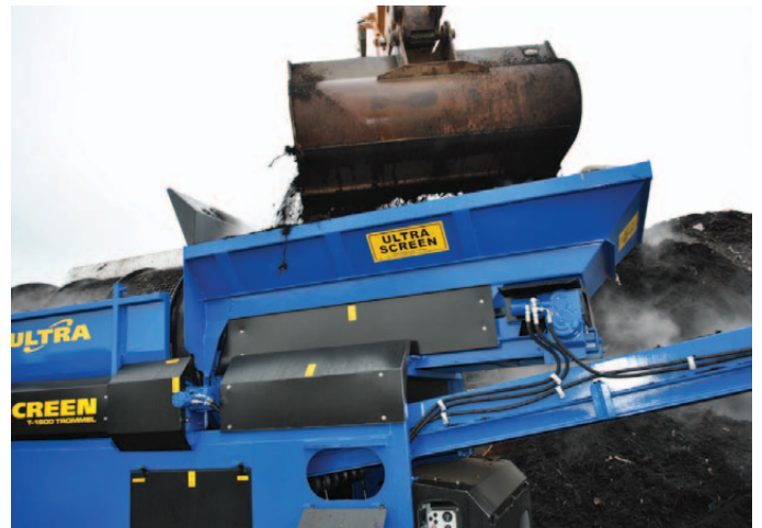
3.5 Cubic Tonne variable speed Feed Hopper, spill plates optional