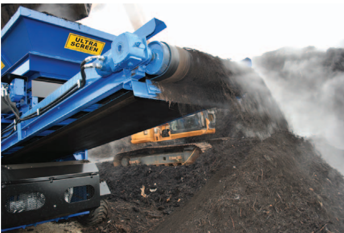
1200mm wide 2.3m high fines stockpile belt, to ensure smooth fines collection and stockpiling