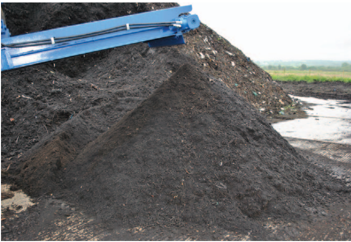
Trommel fines collection rates ranging from 35 to 60 cubic tonnes per hour.